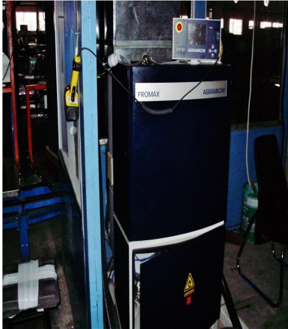
Pro-Max-F Charging Station with Barcode Scanner

Total Twenty Two Leybold Vacuum Pumps with CVC-NANO each are installed, Ninety Nine CPT-XD Boxes are installed with Two Temperature Sensors Each for both freezer and refrigerator compartments of a cabinet. Logger PC is installed to record all the manufactured cabinet's log starting from assembly to its packing based on unique Barcode for better traceability and to improve productivity. The system is running smoothly since June, 2012.